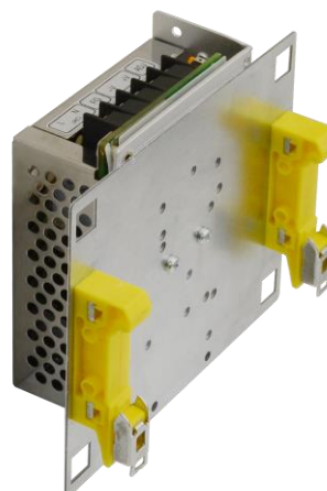
Fig. 2. Example of power supply mounting: PSB-351225